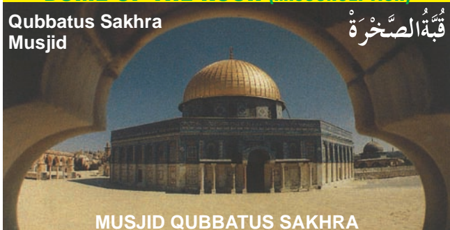
MUSJID QUBBATUS SAKHRA