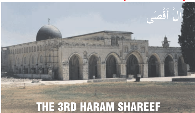
THE 3RD HARAM SHAREEF