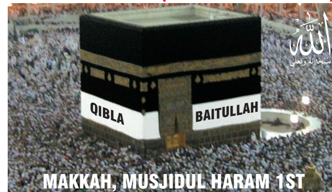
MAKKAH, MUSJIDUL HARAM 1ST

When uttering the name of Allah ﷻ (Subhaa nahoo wa ta'aala) say: Sub-haa-na-hoo wa ta'aa-la.